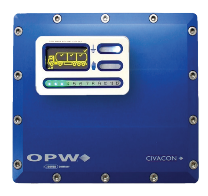
NOTE: Based on the truck-wiring configuration, the 8870 Rack Monitor truck graphic displayed may vary.