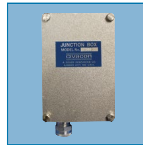
7500-7500* Junction Box

*Breakaway cord and junction box options are available. Visit www.opw-es.com for more information.