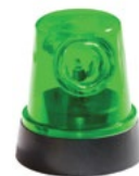
The monitor verifies that the plug is properly seated after fueling. In this example, a relay has been configured to display a green-light indicator light when the plug is properly seated (not included)