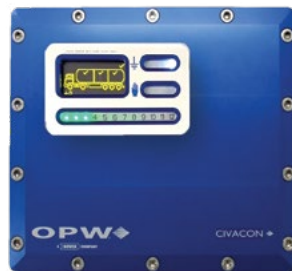
The Rack Monitor detects if the plug is properly seated