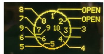
The cable connections are verified and status displayed (8870N only)