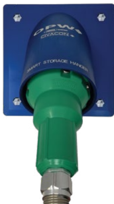
Connect the plug to the Smart Storage Hanger receptacle