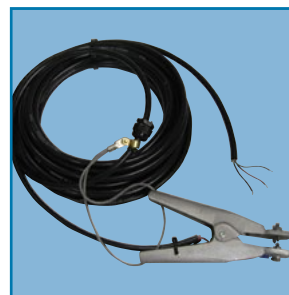
7720-7720* Ground Clamp with 40' Wire