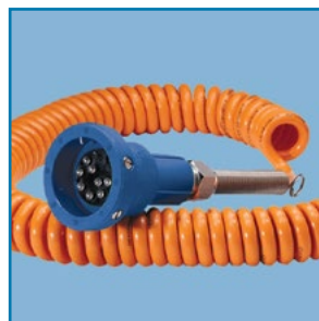
7100-7100* 5-Wire Blue Optic Plug & Cord