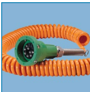
7300-7300* 2-Wire Green Plug & Cord