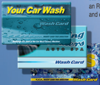
Mag Stripe Card