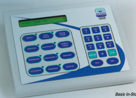
Basic In-Store POS